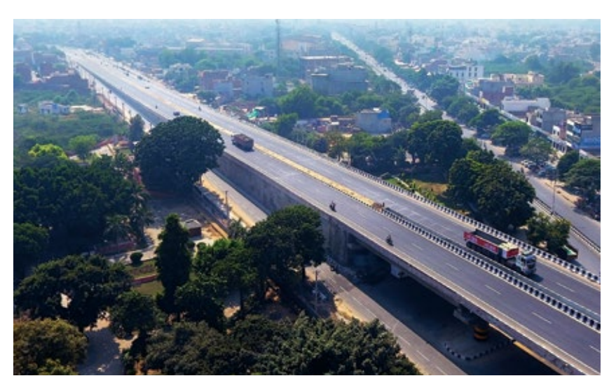
The Zirakhpur-Bathinda stretch of NH-64 is well equipped with a three-grade separator flyover bridge, four underpasses, one rail over-bridge, seven minor bridges over river and 38 culverts, among others.